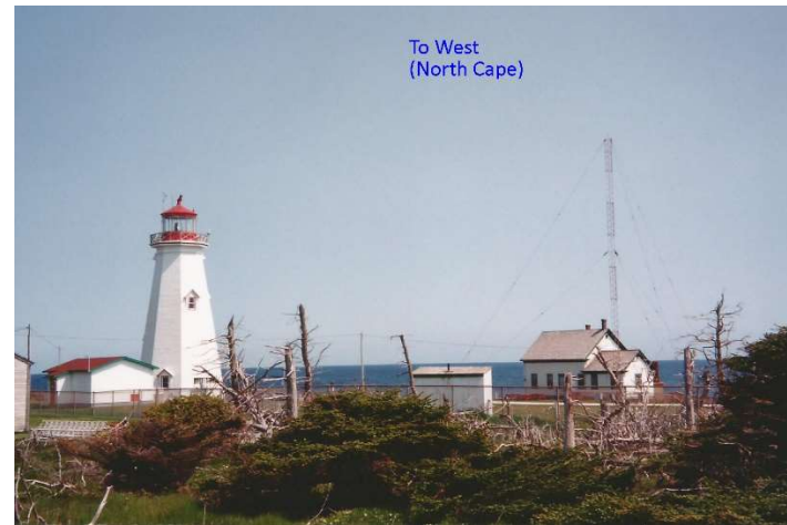
To West (North Cape)