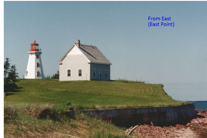
From East (East Point)