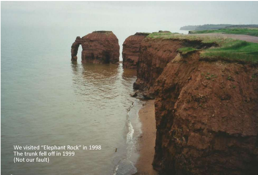
We visited "Elephant Rock" in 1998 The trunk fell off in 1999 (Not our fault)