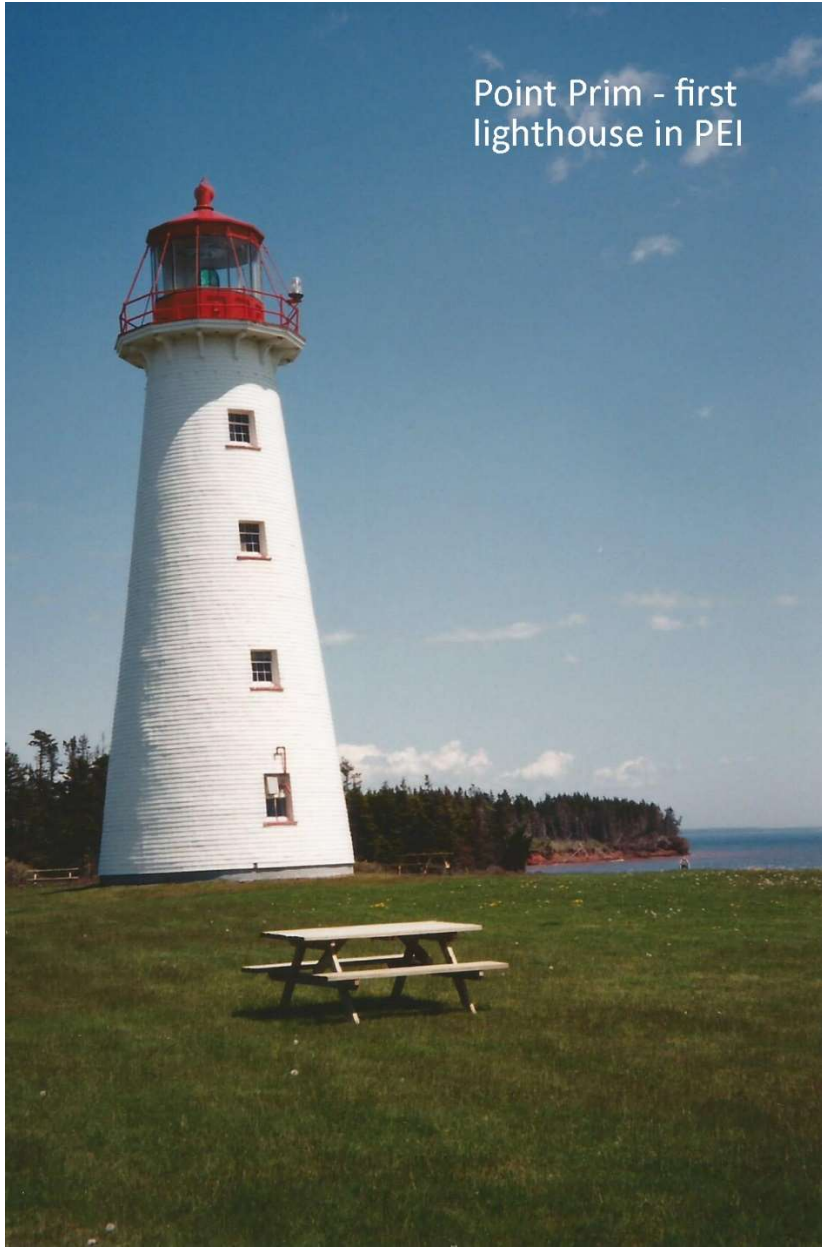
Point Prim - first lighthouse in PEI